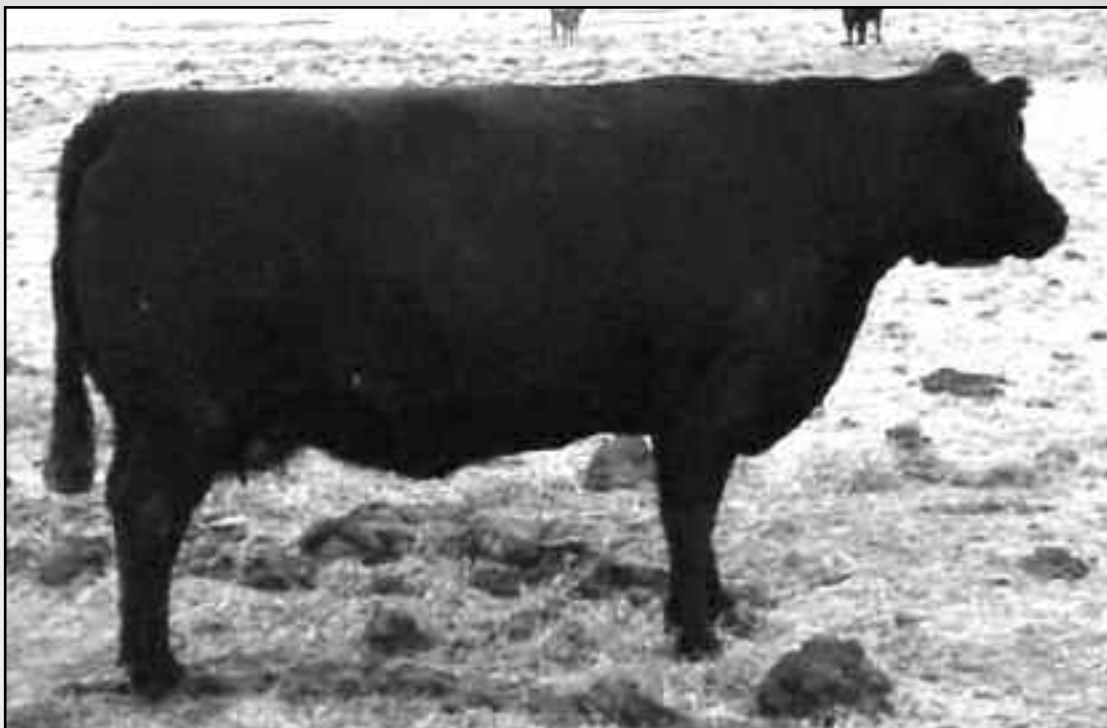
AR Ebony Rose 19F – Lot 21