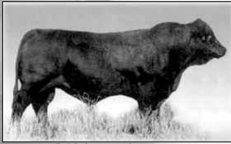
RTC Atlas 712G – Sire of Lot 25

Tinsel shows the moderate frame and great udder quality typical of Garey daughters. Safe to Special Agent whose full sister sold at Farmfair this fall. PE May 14 to June 10 to SLC Head Start. PE June 10 to July 10 to ULL Special Agent 8N