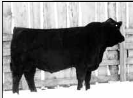
SLC Master Plan 134N Service Sire of Lot 4

A black, polled Rated R daughter that sells mated early to Master Plan. Vet calls her safe to AI date. AI - April 29/04 to SLC Master Plan.