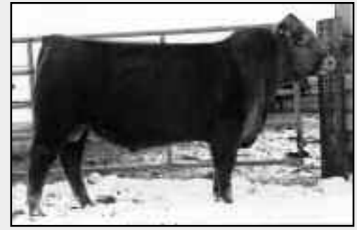
SLC Head Start Service Sire of Lots 24 & 27