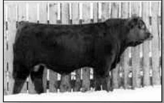
SLC Merv – Service Sire of Lot 12