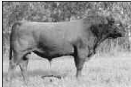
Stubby - Sire of Lot 1

We are offering 1/2 interest in 120H. She is bred back to "JR" again this year for a February baby. Exposed to Blackjack Jr from May 8 to June 30/04