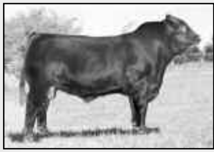
SLC Freedom 178F Sire of Lot 2