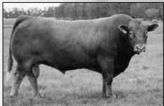
NGAC Remitall Pld Excel – Sire of Lot 17

A very deep-bodied daughter of Excel that will be at the National Show this fall. This is the last set of Excel calves. We lost him last fall.