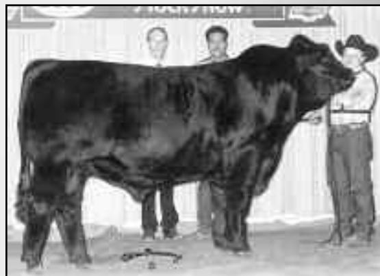
SLC Rated – R80H – Sire of Lot 4

188C is the deepest-bodied cow at SLC. She has been very productive. This dark red, easy fleshing female sold for $19,500 for 1/2 interest at our 2000 Female Sale to Larry Dutson, Delta, Utah. We are selling two packages of 3 embryos. We will guarantee 2 pregnancies out of each package of three.