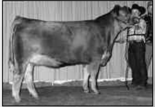
SLC Free Elegance 13H – Dam of Lot 12

A nice daughter of Flashpoint, out of 13H, the 1999 National Champion Female that went on to be the high selling female in our '99 Female Sale, selling for $29,000 to River View Gelbvieh in MN. She sells bred to SLC Merv, the $15,000 son of Freedom that sold to Drader Farms at Brooks, AB, and the 2003 National Champion Stubby daughter. Vet calls her safe to AI breeding date. AI - SLC Merv on May 7/04