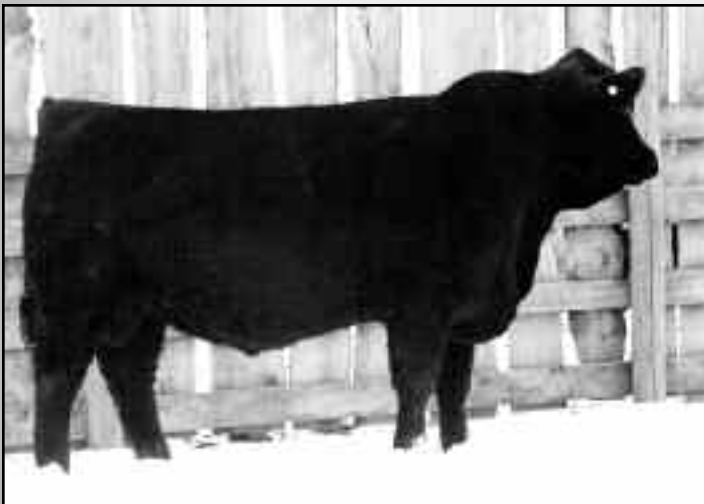
SLC Master Plan 134N