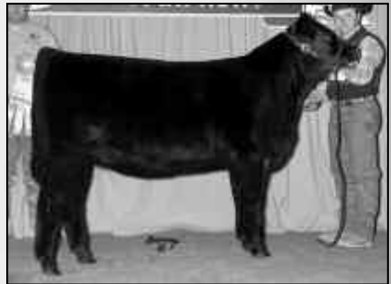
SLC 136L - Daughter of Lot 1

This black Stubby daughter has really done a nice job at SLC. She is a Dam of Merit and has earned the right to be a donor cow. She is sharp fronted, thick made and easy fleshing, with a near perfect teat and udder structure. We will be showing her at the National Show this Fall, along with her "JR" bull calf, who is also our People's Choice Bull Futurity entry.