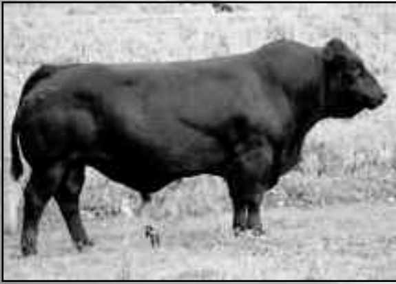
VG Valley Blackjack Jr 37H Service Sire of Lot 2