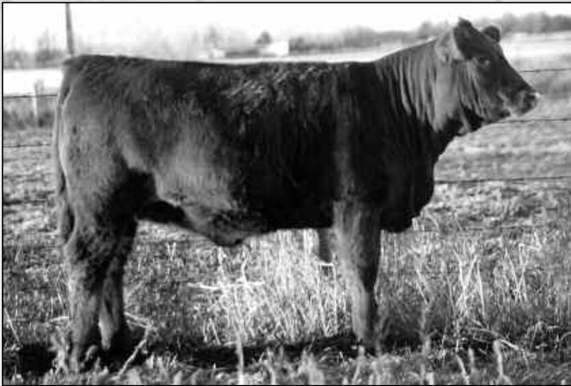
Showing This Fall!! SLC Sadie 47P – Lot 16