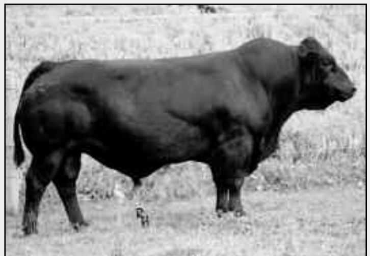
VG Valley Blackjack Jr 37H