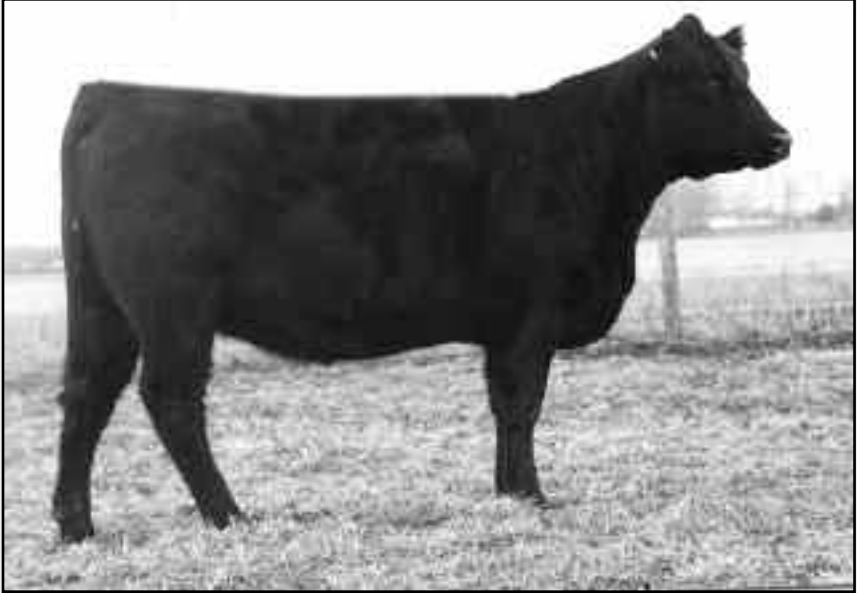
SLC Lady 232N – Lot 11