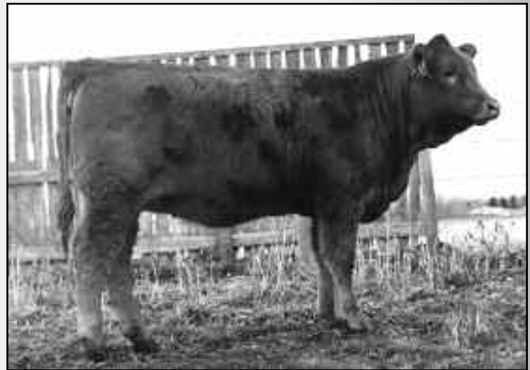
Showing This Fall!! SLC Red Lady 124P – Lot 17

This dark red Freedom daughter will be shown with her mother this fall. Her dam, SLC Sadie 231M, was the Res. Jr. Champion Female last year at Farmfair as well as the Gelbvieh Champion at the First Lady Classic show at Agribition. 47P is the front pasture kind.