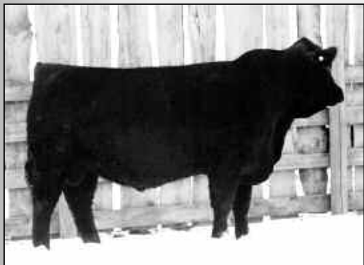
SLC Master Plan – Option of Service to Lots 18 & 19

Two black, polled, top cut heifers, that will sell with the option to AI to Master Plan, the $19,000 black polled high-selling bull at our March Sale.