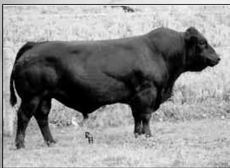
VG Valley Blackjack Jr 37H Sire of Lots 18 & 19

A dark red daughter out of 38H, the $5,700 cow from the Anchor Ridge Sale last fall.