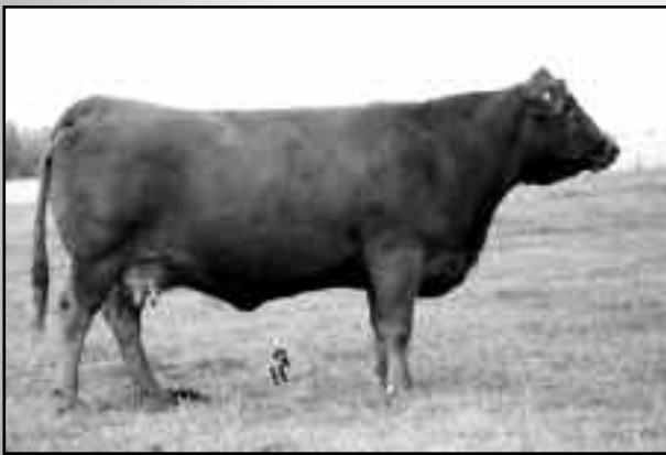
SLC Anita 19F - Dam of Lot 2