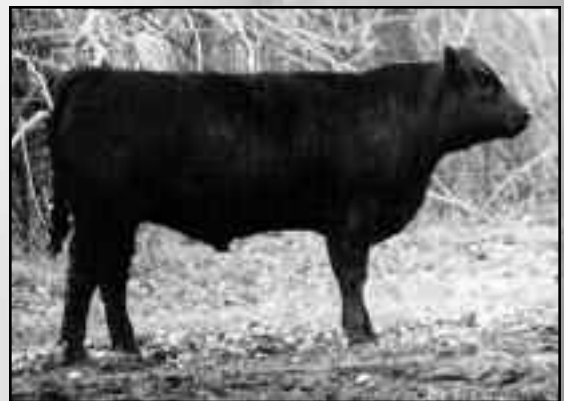
SLC Dallas 195P - Son of Lot 1