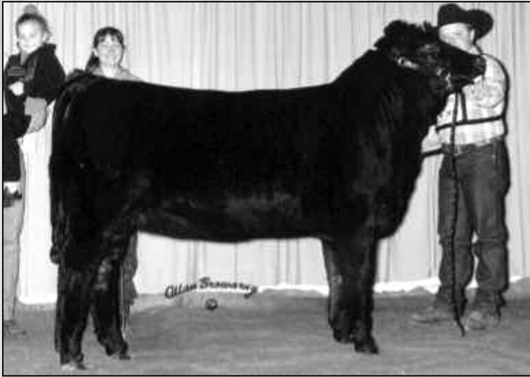
TJB Vixen 918J ET - Lot 5