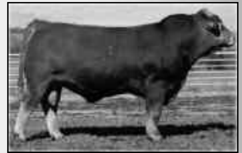
JRI Pld Free Agent Sire of Lots 26 & 27