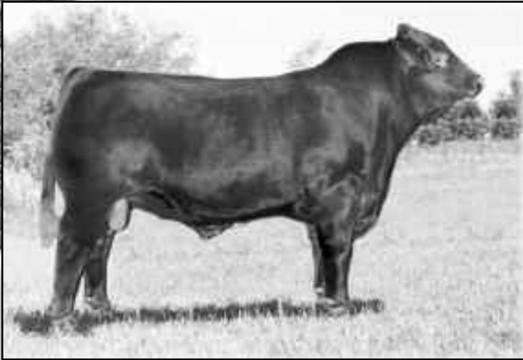
SLC Freedom 178F